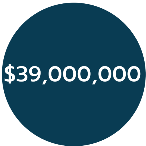
Total fund size