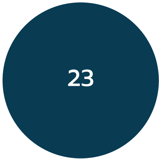
Number of investments