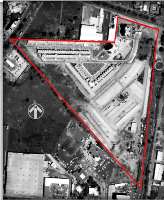
Fig. 2: March 12, 2012, Benevento satellite image