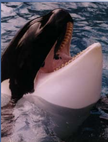
Orcas roam the Puget Sound, with sightings not uncommon on Bellingham's shores.