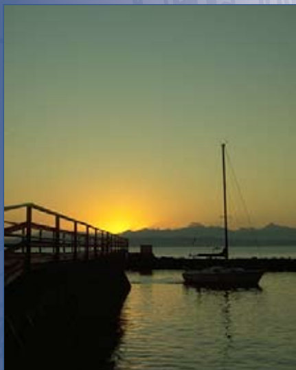
Bellingham is often rated as one of the most-livable medium-sized cities.