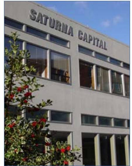
Saturna Capital's offices on the corner of State and Holly streets, in the center of downtown Bellingham.

Saturna Capital encourages its employees to be involved in community organizations and events, and they are active in a range of civic and charitable activities. It donates generously to charity, including matching employee donations. Emphasis is placed on education, particularly programs at Western Washington University and St. Paul's Academy (Bellingham). Downtown Bellingham's historic Mt. Baker Theatre – shown here – receives assistance from donations to organizations such as the Whatcom Symphony Orchestra, Bellingham Film Festival, and music events.