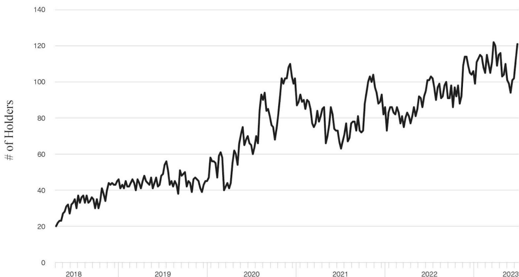
CME Bitcoin Futures Large Open Interest Holders (LOIH)

The number of large open interest holders 20 has increased as well, even in the face of heightened bitcoin price volatility, as demonstrated in the figure that follows.