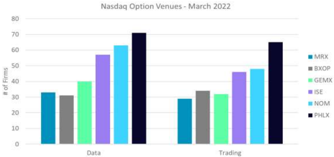
Chart 2: Number of Firms with Access to Market Data and Purchasing Trading Services from Options Venues (March 2022)

Chart 2 shows that 34 firms subscribed to at least one market data product from MRX in the first quarter of 2022. This is the second lowest number of firms purchasing market data from the Nasdaq-affiliated options exchanges.