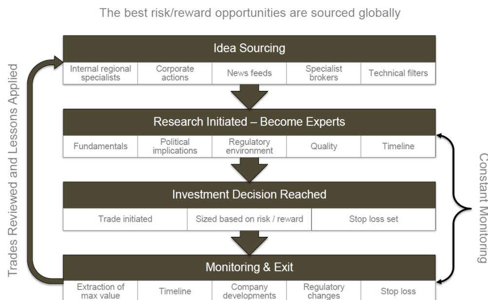
Figure C: Omni Event strategy investment process