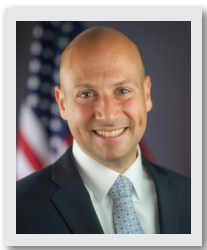
ELAD ROISMAN SEC Commissioner