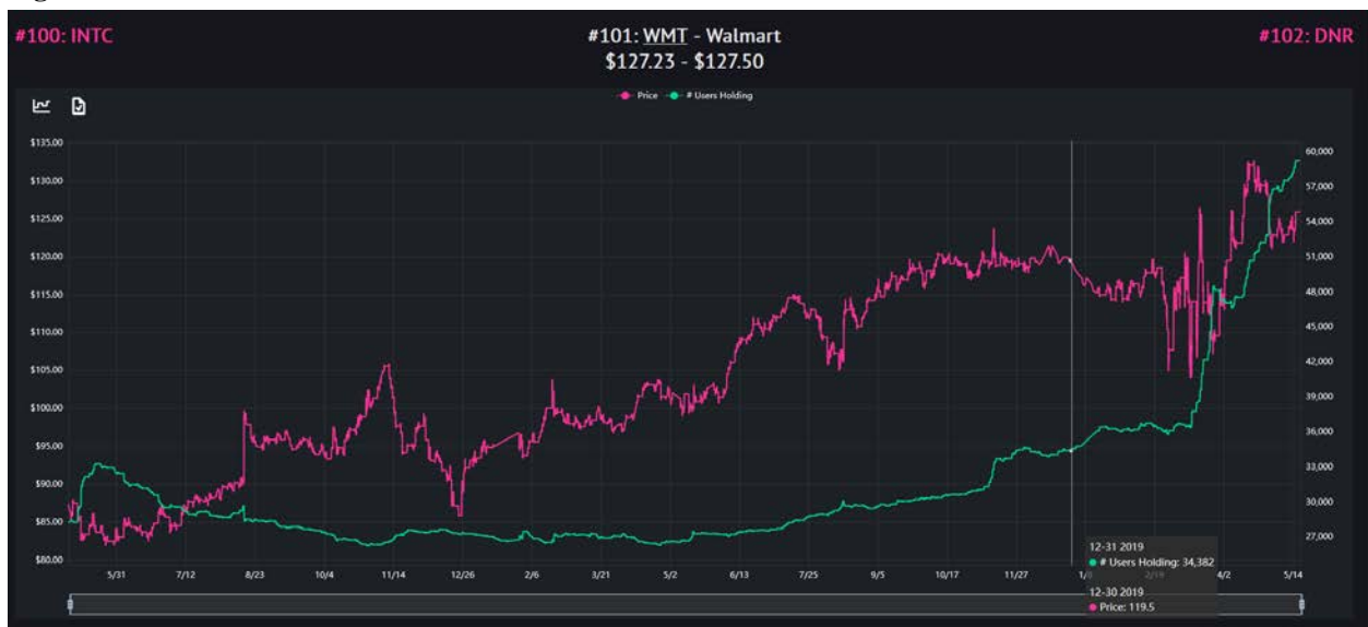
Figure 2: Time Series of Retail Investor Positions on Robintrack

The figure provides a screen shoot of https://robintrack.net/symbol/WMT as of May 18, 2020, which includes the time series of retail investor positions for Walmart from May 1, 2018 to May 18, 2020.