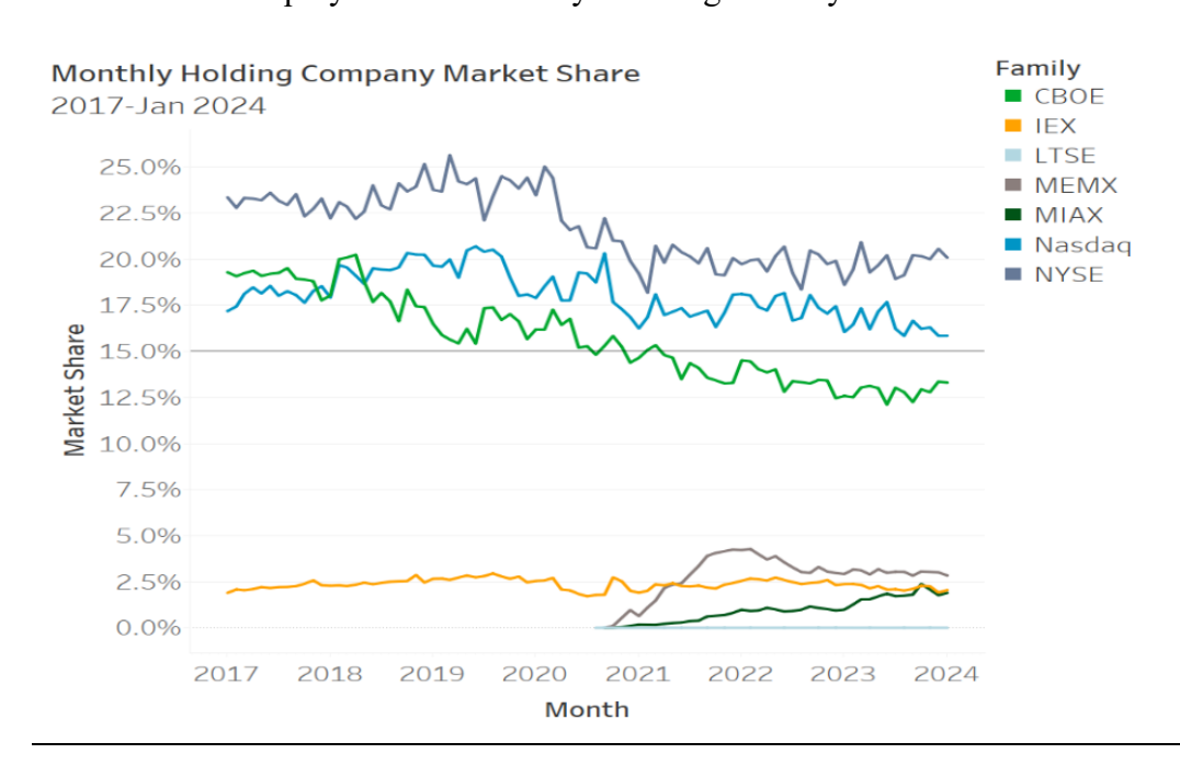
Chart 1: Trends in Equity Market Share by Exchange Family

The data used by the Commission to set this threshold are outdated and will continue to be outdated as trends are unlikely to reverse. Chart 1 shows market share by equity market participant for the last six years.