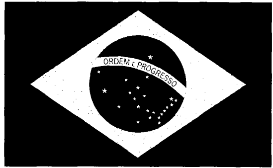
The Comissão de Valores Mobiliários of Brazil

Concerning Consultation, Cooperation and the Exchange of Information Related to the Supervision of Cross-Border Regulated Entities