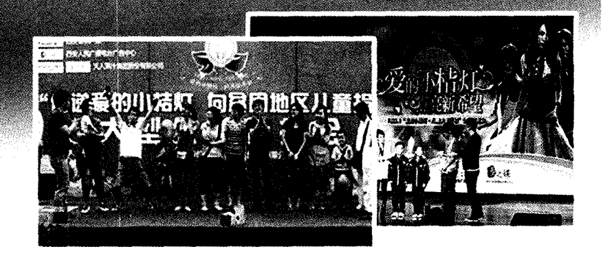
SkyPeople Fruit Juice is one of the sponsors and allied members for public welfare activity "Little Orange Lamp. Child Care Campaign."