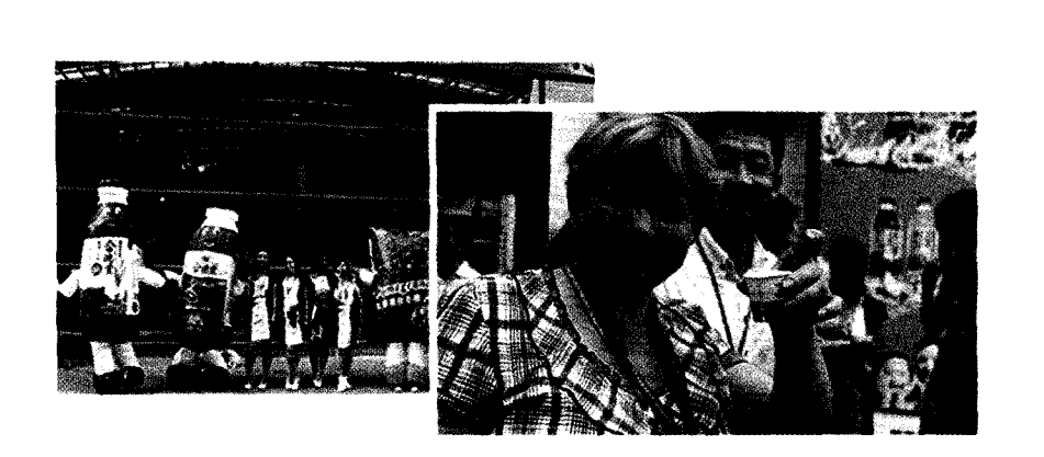
SkyPeople Fruit Juice is the only designated fruit juice beverage provider for China's Got Talent Show venue in Xi'an.