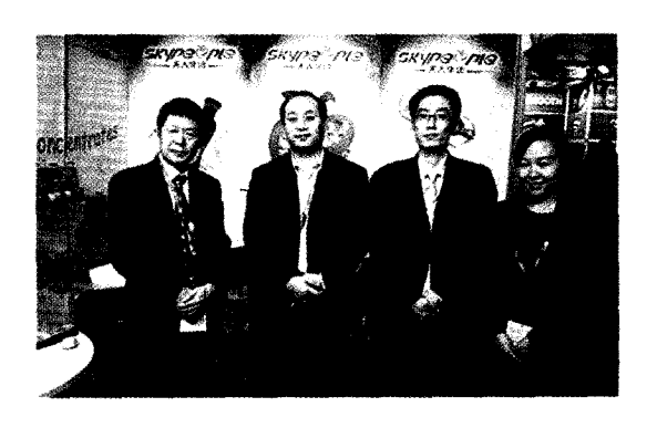
SkyPeople Fruit Juice presented its products at ANUGA fair in Cologne, Germany from October 8-12, 2011.