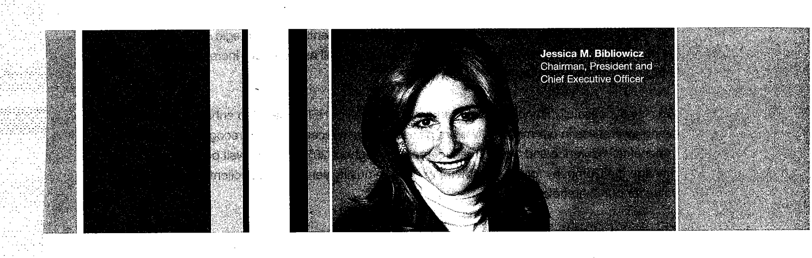
My Fellow Shareholders,

We accomplished a great deal in 2010, highlighted by a return to organic revenue growth. During the year we improved our financial flexibility by continuing to generate strong cash flow and completing a multistep recapitalization.