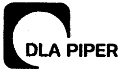
Exhibit A Certification