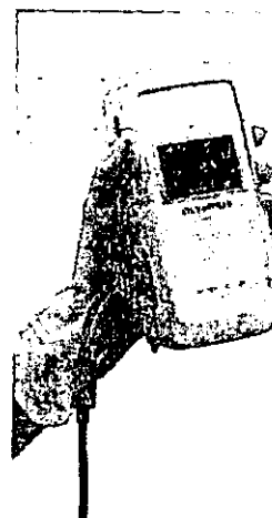
Real Time Viewer

*This is based on Olympus research as of October 13,2005 and refers to capsule endoscopes.