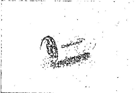
External view of the Capsule Endoscope

By expanding its product line to include small bowel endoscopes, capsule endoscopes and EndoTherapy products, Olympus aims to contribute to the improvement of safe, reliable and efficient diagnosis and treatment solutions for small bowel conditions.