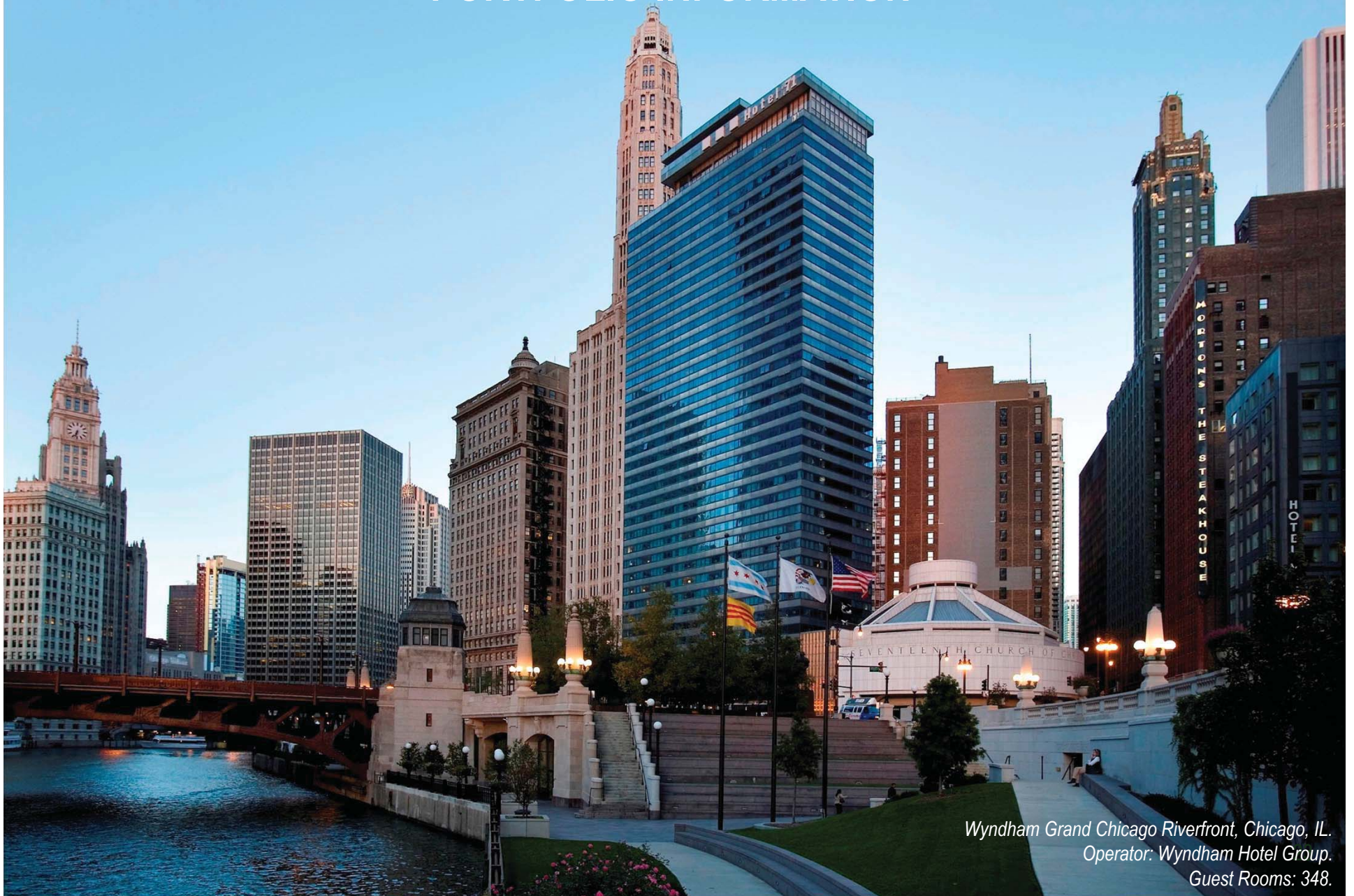
Wyndham Grand Chicago Riverfront, Chicago, IL. Operator: Wyndham Hotel Group. Guest Rooms: 348.