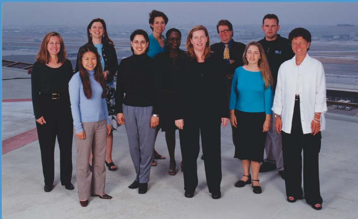
The DIRECTV E-Business team members responsible for bringing DIRECTV.com to the fore are, left to right: