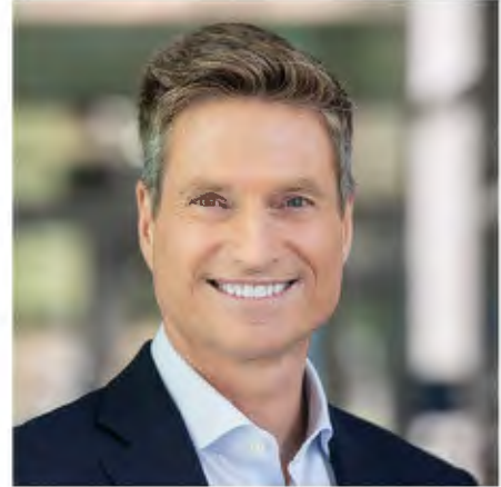
James D. Taiclet Chairman, President and Chief Executive Officer

In 2022, Lockheed Martin continued to develop and deliver critical 21st-century capabilities for our customers to enhance deterrence to armed conflict and to advance scientific discovery. We also boldly advanced our internal business and digital transformation. And we utilized our dynamic capital allocation process that integrates our business results and expectations, along with market and financial conditions, to maximize returns for our stockholders.