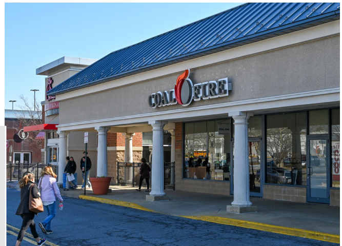
KENTLANDS, GAITHERSBURG, MD