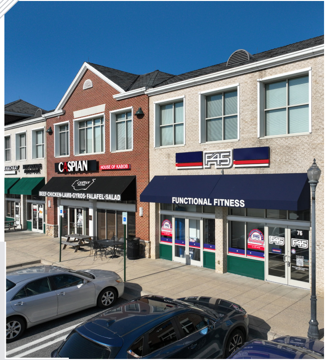
KENTLANDS, GAITHERSBURG, MD