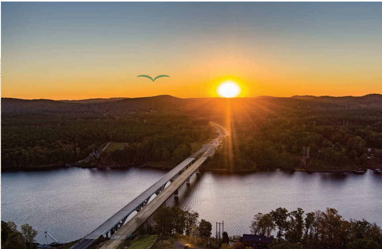
My Different Perspective

Uwharrie Capital Corp remains strong and focused on improving economic opportunities for our customers and our communities. We hold a special mission that does not define us as just a bank, but as an economic engine providing both capital and intellect for facing and building a sustainable economic future for the communities we serve.