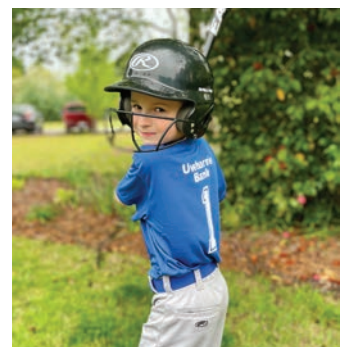
At Uwharrie, we work hard to keep local money close to home, including on the hometown ball fields.