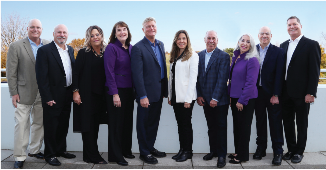
Your JBSS Board of Directors