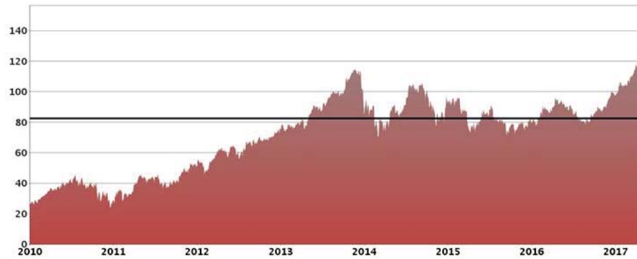
LyondellBasell Industries N.V. – Daily Closing Prices October 14, 2010 to February 23, 2018

Based on the Performance of the Ordinary Shares of LyondellBasell Industries N.V. Principal at Risk Securities