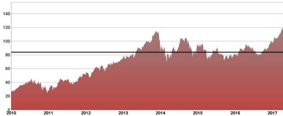
LyondellBasell Industries N.V. – Daily Closing Prices October 14, 2010 to February 14, 2018

Based on the Performance of the Ordinary Shares of LyondellBasell Industries N.V. Principal at Risk Securities