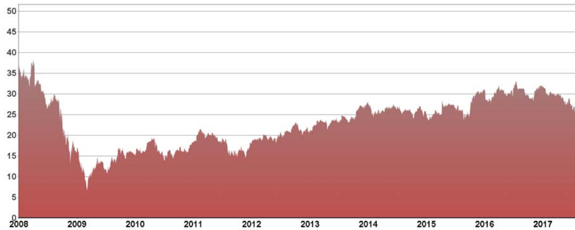
General Electric Company – Daily Closing Prices January 2, 2008 to August 18, 2017

Based on the Performance of the Common Stock of General Electric Company Principal at Risk Securities