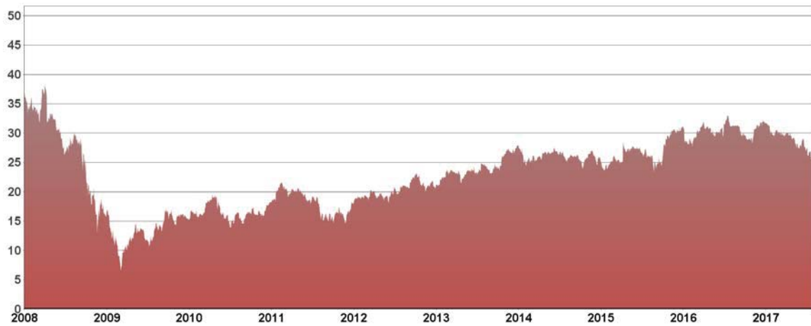
General Electric Company – Daily Closing Prices January 2, 2008 to August 8, 2017

Based on the Performance of the Common Stock of General Electric Company Principal at Risk Securities