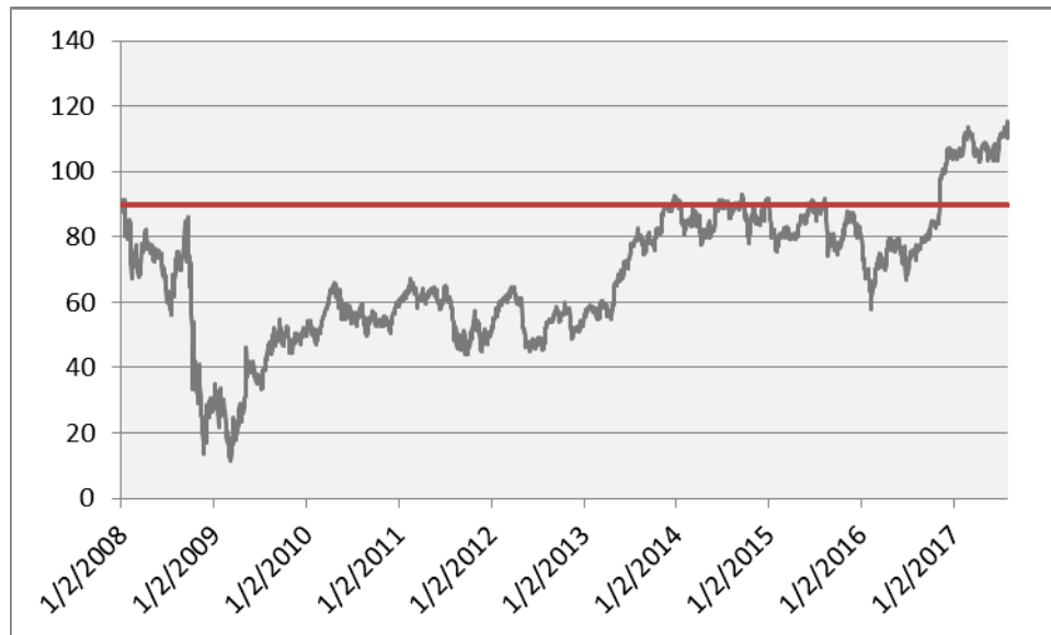
Prudential Financial, Inc. – Daily Closing Prices January 2, 2008 to August 4, 2017

Based on the Performance of the Common Stock of Prudential Financial, Inc. Principal at Risk Securities