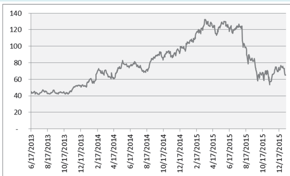
Ordinary Shares of Mallinckrodt Public Limited Company – Daily Closing Prices June 17, 2013 to January 11, 2016