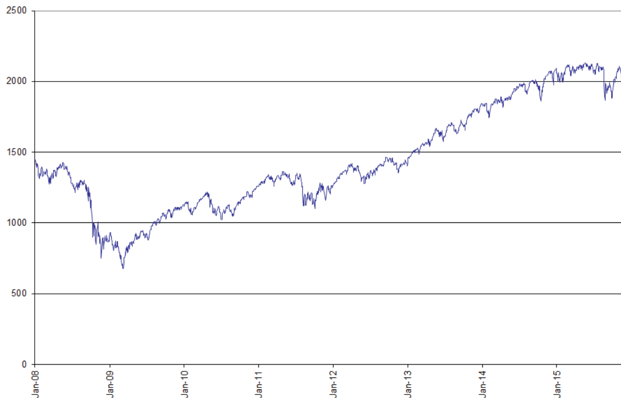
S&P 500® Index Daily Closing Levels January 1, 2008 to November 24, 2015

The following graph sets forth the historical performance of the S&P 500® Index based on the daily historical closing levels from January 1, 2008 through November 24, 2015. The closing level for the S&P 500® Index on November 24, 2015 was 2,089.14. We obtained the closing levels below from the Bloomberg Professional® service. We have not independently verified the accuracy or completeness of the information obtained from the Bloomberg Professional® service. The historical levels of the S&P 500® Index should not be taken as an indication of future performance, and no assurance can be given as to the level of the S&P 500® Index on the valuation date.