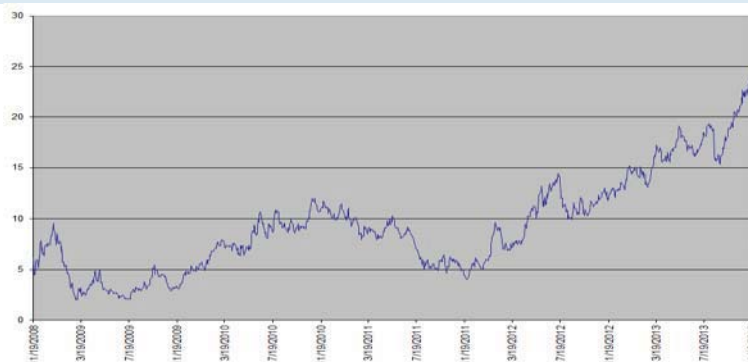
US Airways Group, Inc. Common Stock – Daily Closing Prices November 19, 2008 to November 19, 2013

We make no representation as to the amount of dividends, if any, that US Airways Group, Inc. may pay in the future. As an investor in the securities, you will not be entitled to receive dividends, if any, that may be payable on the common stock of US Airways Group, Inc.