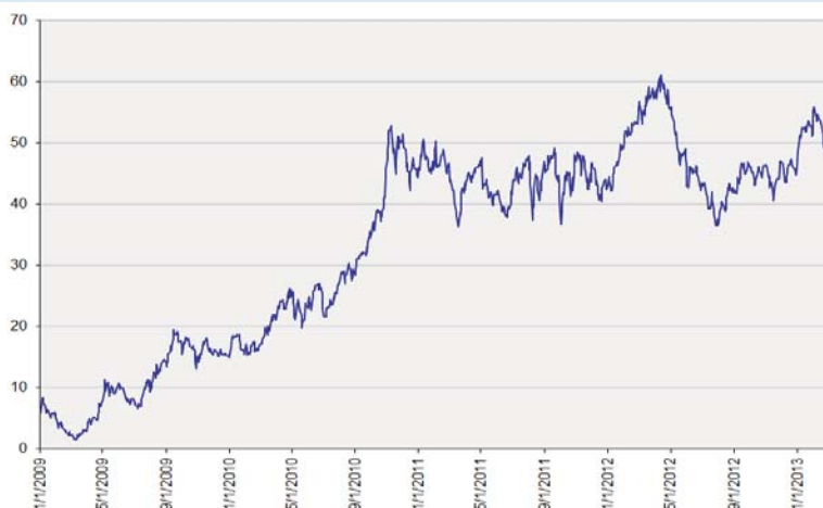
Las Vegas Sands Corp. Common Stock – Daily Closing Prices January 1, 2009 to March 12, 2013

We make no representation as to the amount of dividends, if any, that the underlying company may pay in the future. As an investor in the securities, you will not be entitled to receive dividends, if any, that may be payable on the common stock of the underlying company.