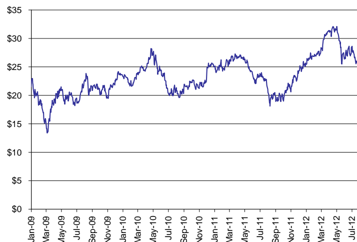
Lowe's Companies, Inc. Common Stock – Daily Closing Prices January 1, 2009 to August 17, 2012

We make no representation as to the amount of dividends, if any, that Lowe's Companies, Inc. may pay in the future. As an investor in the securities, you will not be entitled to receive dividends, if any, that may be payable on the common stock of Lowe's Companies, Inc.