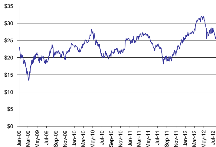
Lowe's Companies, Inc. Common Stock – Daily Closing Prices January 1, 2009 to August 13, 2012

We make no representation as to the amount of dividends, if any, that Lowe's Companies, Inc. may pay in the future. As an investor in the securities, you will not be entitled to receive dividends, if any, that may be payable on the common stock of Lowe's Companies, Inc.