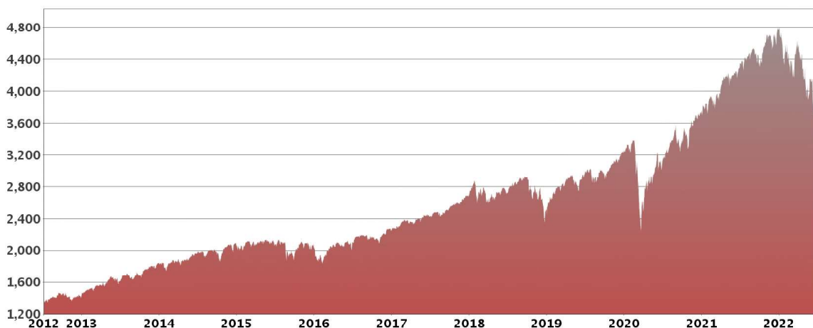
Historical Performance of the S&P 500® Index

The graph below is based on the daily historical closing levels of the Underlier from July 6, 2012 through July 6, 2022. We obtained the closing levels in the graph below from Bloomberg Professional® service, without independent verification.