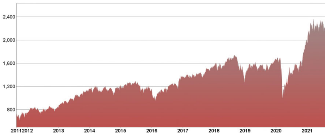
Historical Performance of the Russell 2000® Index – Daily Closing Levels August 24, 2011 to August 24, 2021

The following graph sets forth the historical performance of the RTY based on the daily historical closing values from August 24, 2011 through August 24, 2021. We obtained the closing values below from the Bloomberg Professional® service. We have not undertaken any independent review of, or made any due diligence inquiry with respect to, the information obtained from the Bloomberg Professional® service.