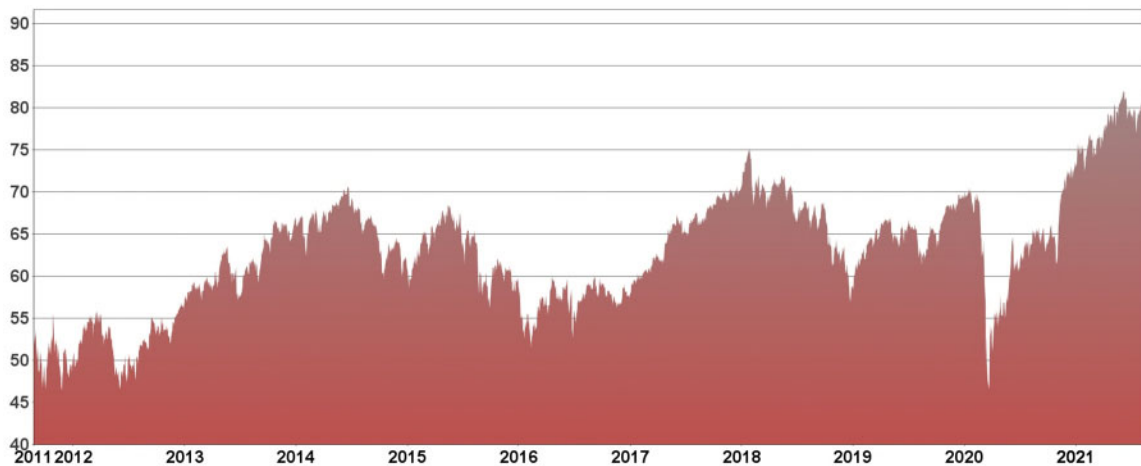
Historical Performance of the iShares® MSCI EAFE ETF – Daily Closing Prices August 24, 2011 to August 24, 2021

The following graph sets forth the historical performance of the EFA based on the daily historical closing values from August 24, 2011 through August 24, 2021. We obtained the closing values below from the Bloomberg Professional® service. We have not undertaken any independent review of, or made any due diligence inquiry with respect to, the information obtained from the Bloomberg Professional® service.