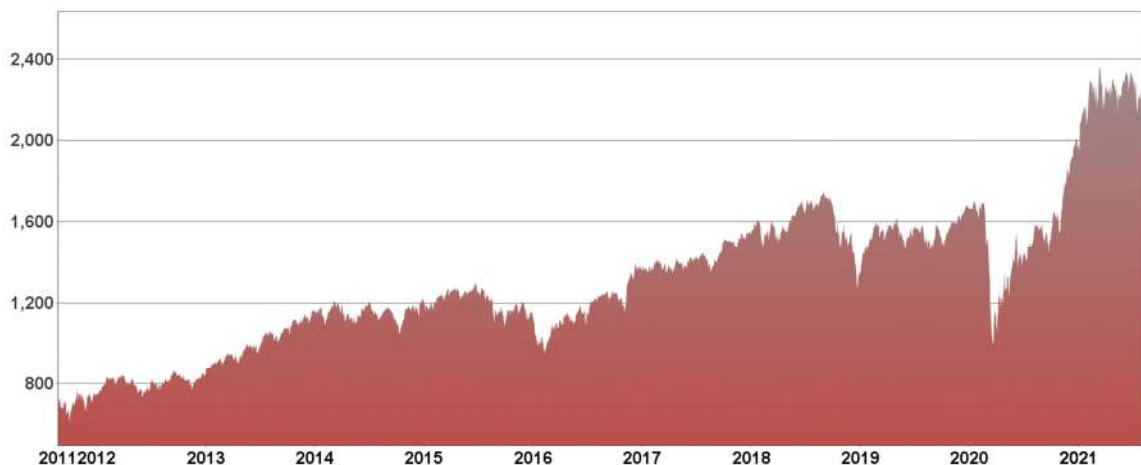
Historical Performance of the Russell 2000® Index – Daily Closing Levels August 24, 2011 to August 24, 2021

The following graph sets forth the historical performance of the RTY based on the daily historical closing values from August 24, 2011 through August 24, 2021. We obtained the closing values below from the Bloomberg Professional® service. We have not undertaken any independent review of, or made any due diligence inquiry with respect to, the information obtained from the Bloomberg Professional® service.