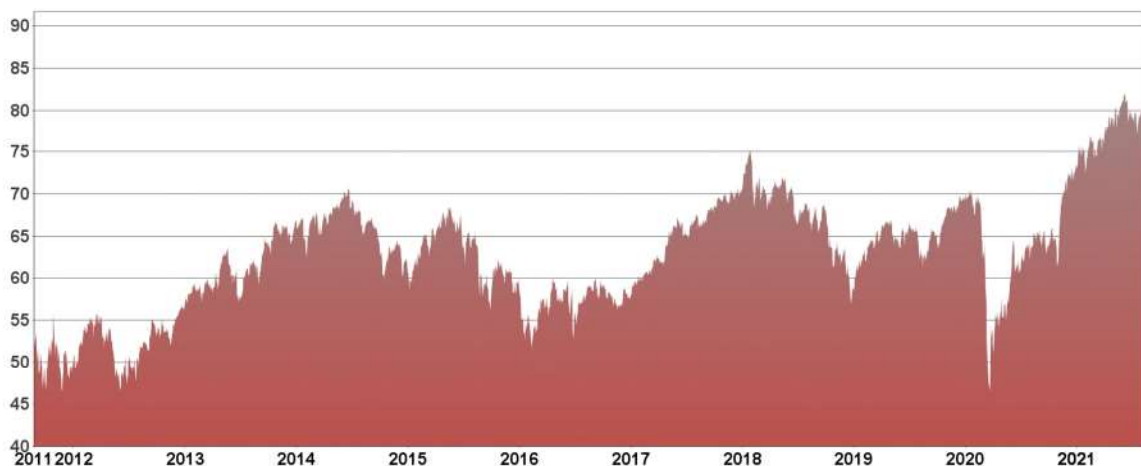
Historical Performance of the iShares® MSCI EAFE ETF – Daily Closing Prices August 24, 2011 to August 24, 2021

The following graph sets forth the historical performance of the EFA based on the daily historical closing values from August 24, 2011 through August 24, 2021. We obtained the closing values below from the Bloomberg Professional® service. We have not undertaken any independent review of, or made any due diligence inquiry with respect to, the information obtained from the Bloomberg Professional® service.