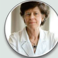
Hon. Wilma Liebman