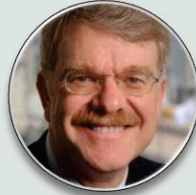
Hon. Joshua Gotbaum