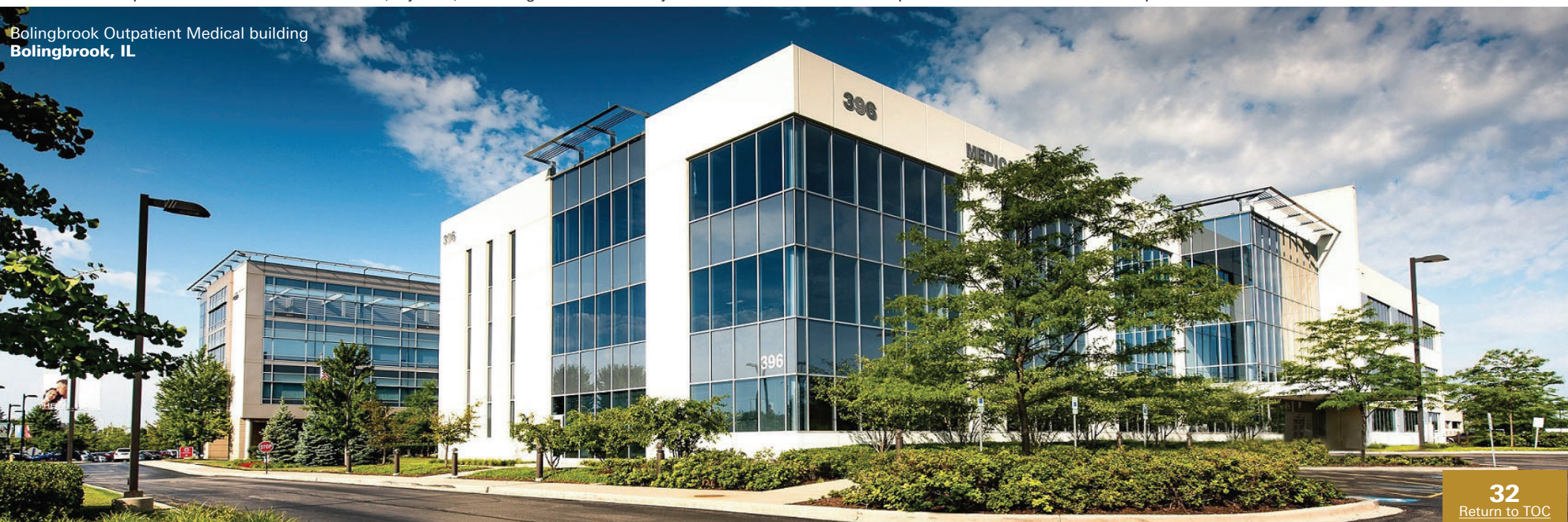
Bolingbrook Outpatient Medical building Bolingbrook, IL

(1) Approximately 50% of operating expenses reported above are recoverable from tenants and are reported gross in both Portfolio Cash Real Estate Revenues and Portfolio Cash Operating Expenses. Pro Forma Portfolio Cash (Adjusted) NOI Margin % has been adjusted to remove recoverable expenses from both revenue and expenses.