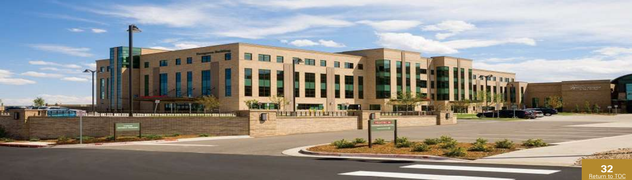
Evergreen at Sky Ridge Lone Tree, CO

(1) Portfolio Cash (Adjusted) NOI Margin is reduced by recoverable expenses that are reported in both Portfolio Cash Operating Expenses and Portfolio Cash Real Estate Revenues.