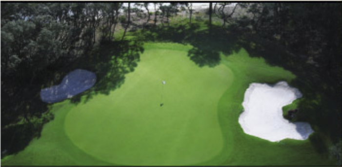
Victoria Park (above) | SouthWood (right)