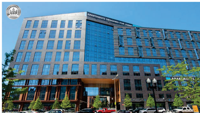
345 Harrison, Boston, MA