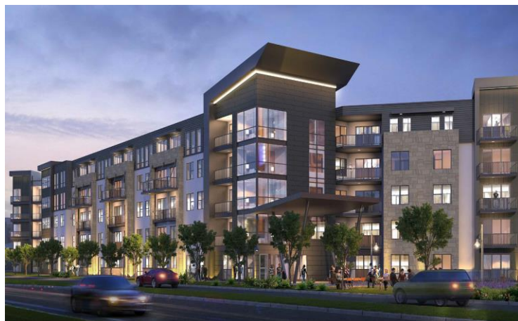
Vitruvian West - Addison, TX