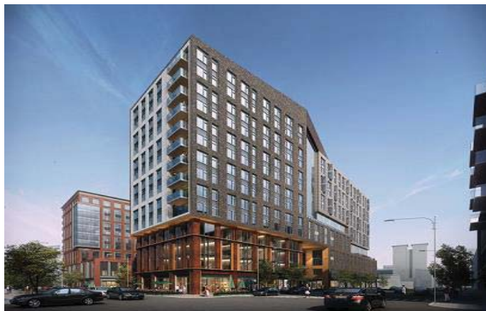
345 Harrison Street - Boston, MA