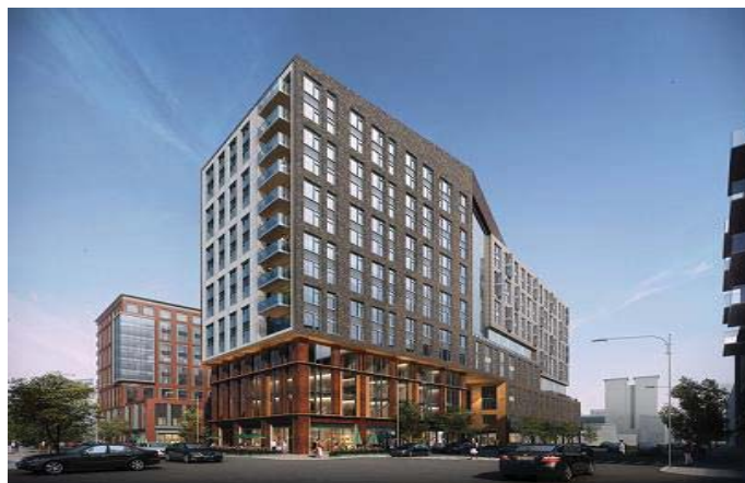
345 Harrison Street - Boston, MA