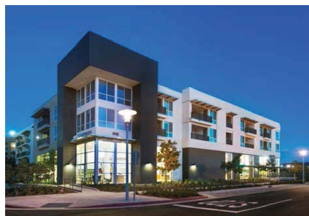
Katella Grand I - Anaheim, CA