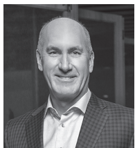
John Stankey, 61 Chief Executive Officer and President