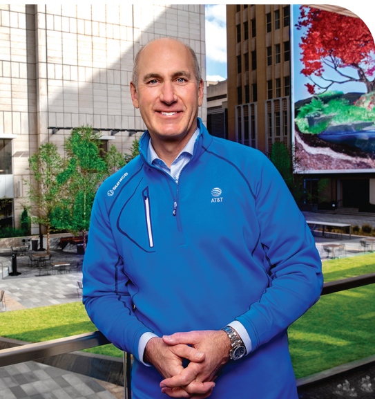
John Stankey Chief Executive Officer

We are making the right moves to deliver high-performance, converged networking at a scale and breadth second to none in the United States. With North America's largest wireless network 2 and the nation's largest 3 and fastest-growing fiber network, 4 no company is better suited to answer the call for widespread connectivity than AT&T.