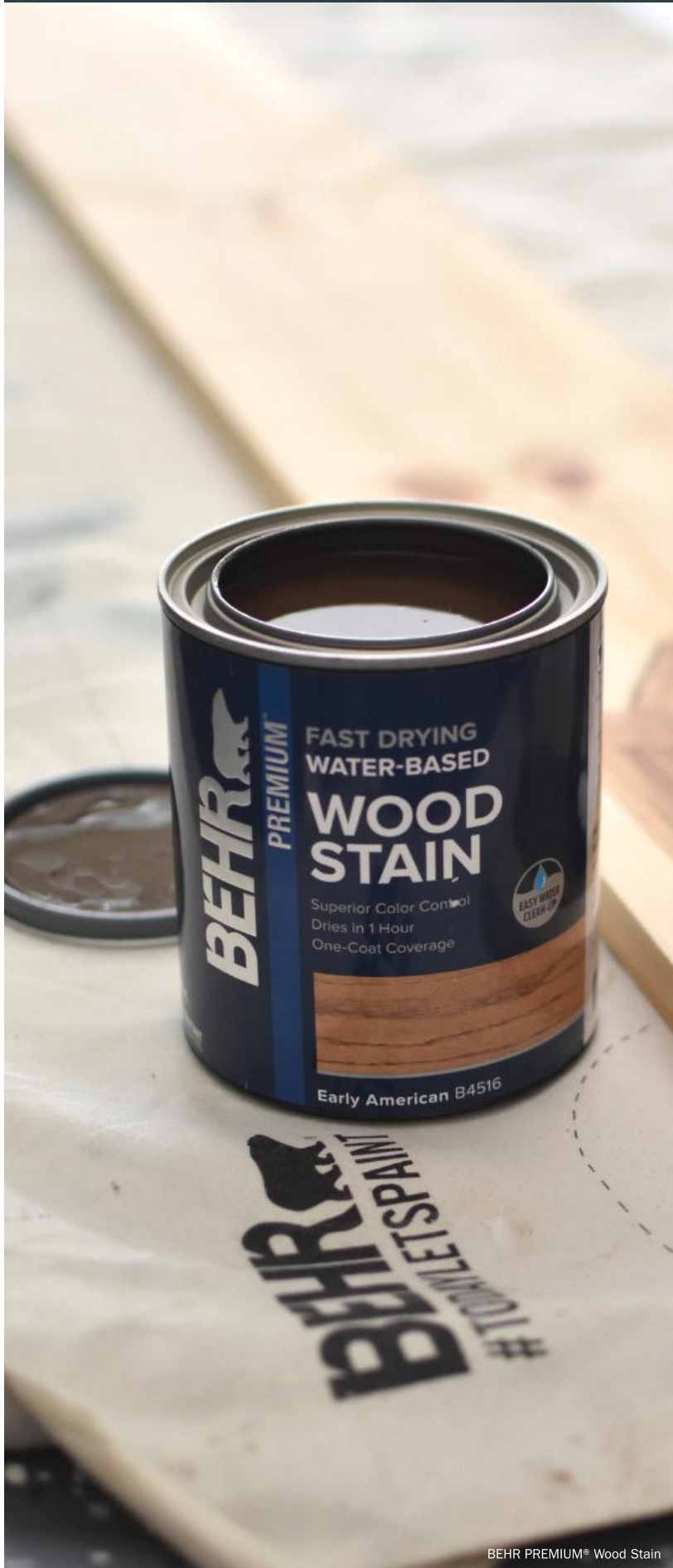
BEHR PREMIUM® Wood Stain