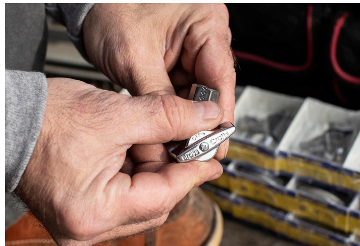
On this page: Kraus® Kore™ Kitchen Sink, Newport Brass Tolmin Widespread Lavatory Faucet, BrassCraft® G2 1/4-Turn Water Stop