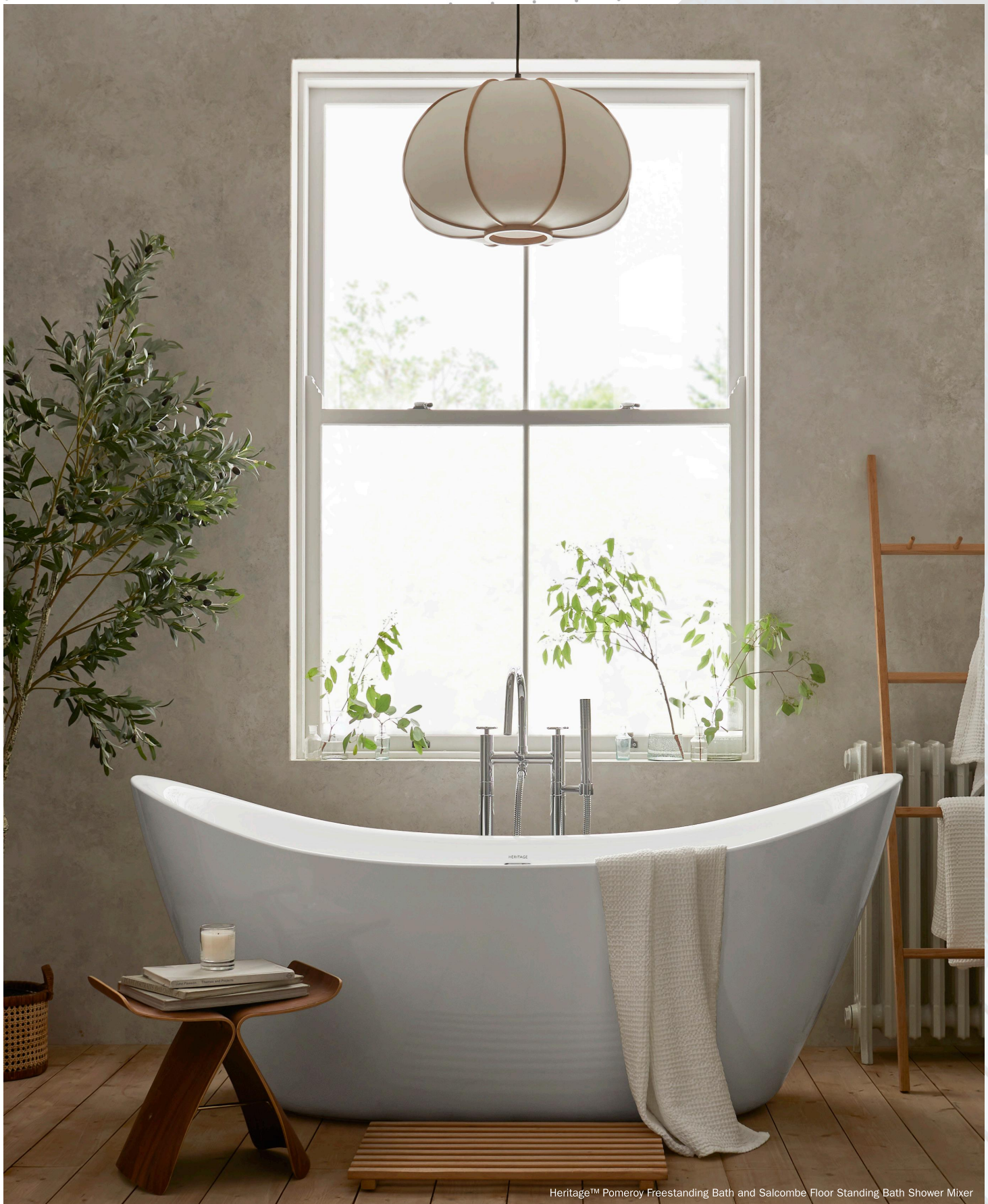
Heritage™ Pomeroy Freestanding Bath and Salcombe Floor Standing Bath Shower Mixer