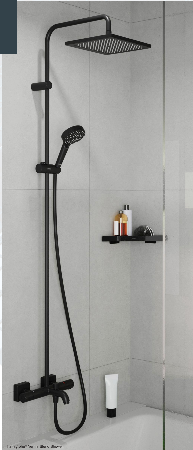
hansgrohe® Vernis Blend Shower