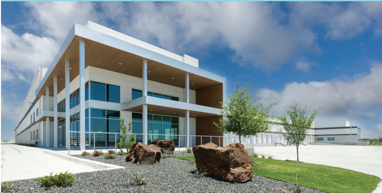
Basswood 35, Fort Worth, Texas