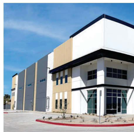
Mesa Gateway Commerce Center, Phoenix, Arizona