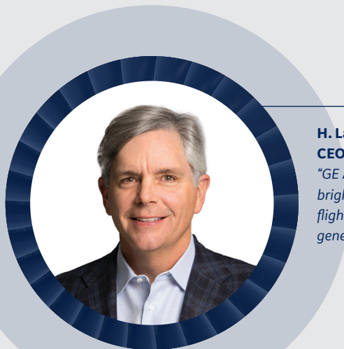
H. Lawrence Culp, Jr. CEO, GE Aerospace

"GE Aerospace has a bright future, defining flight for the next generation."