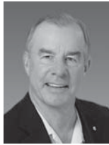
Thomas B. Fargo