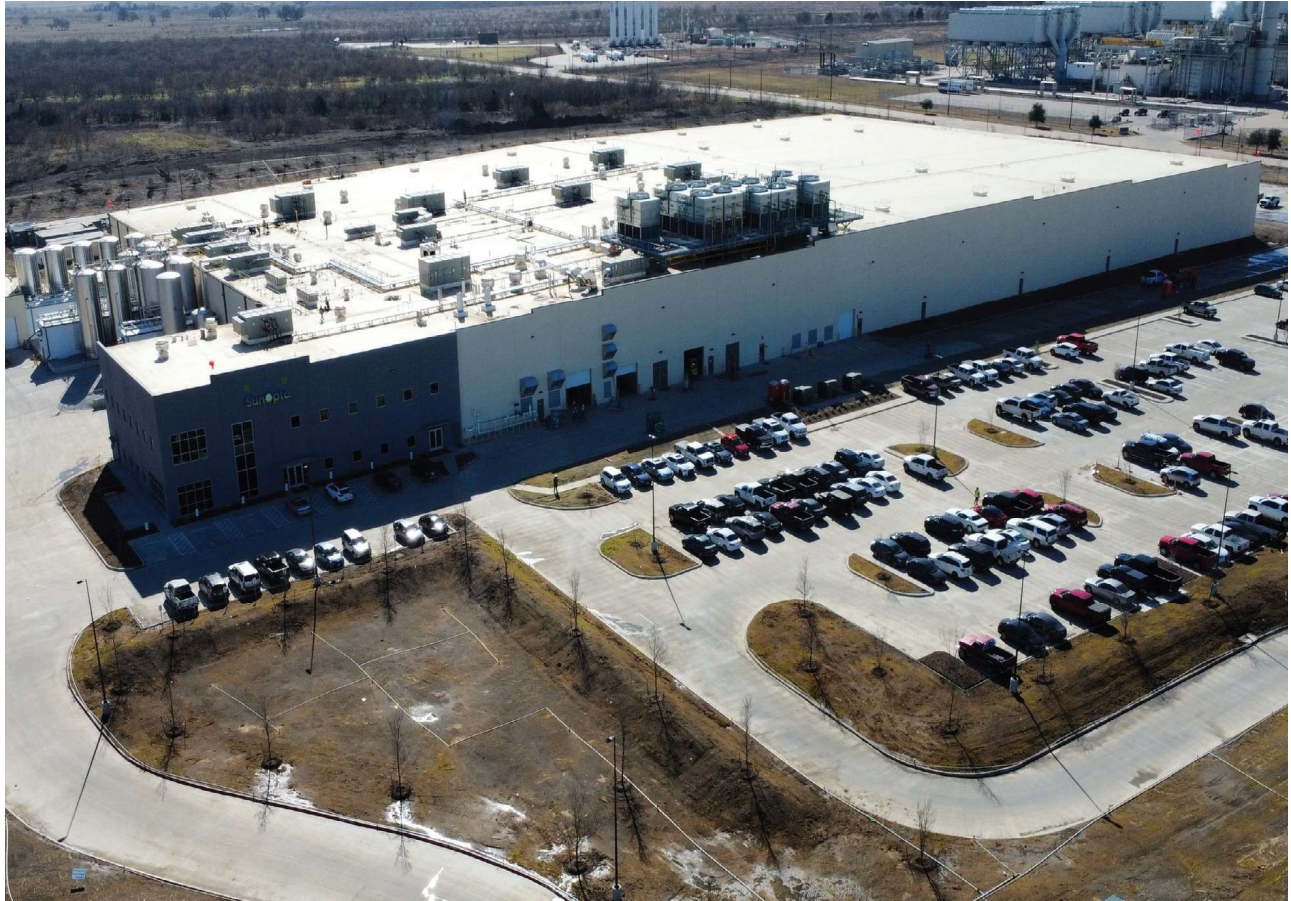
Mega facility in Midlothian, Texas