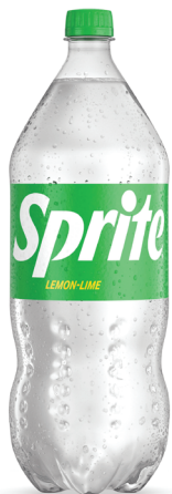
NEW SPRITE BOTTLE USING ONLY CLEAR PET PLASTIC.

This year, Sprite transitioned all plastic PET packaging from its signature green bottle to clear. Green PET is recyclable, but often ends up in single use plastics. Taking color out of bottles improves the quality of the recycled material, keeping more bottles in the circular economy.